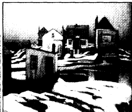
Lawren S. Harris